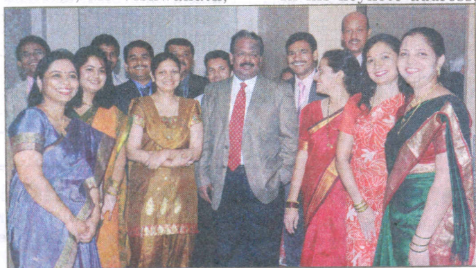
The Mumbai Team